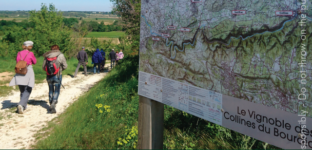
Alcohol abuse is dangerous for your health – Drink responsibly – Do not throw on the public highway.

Our wineries labelled Quality Tourism Occitanie Sud de France welcome you all year round